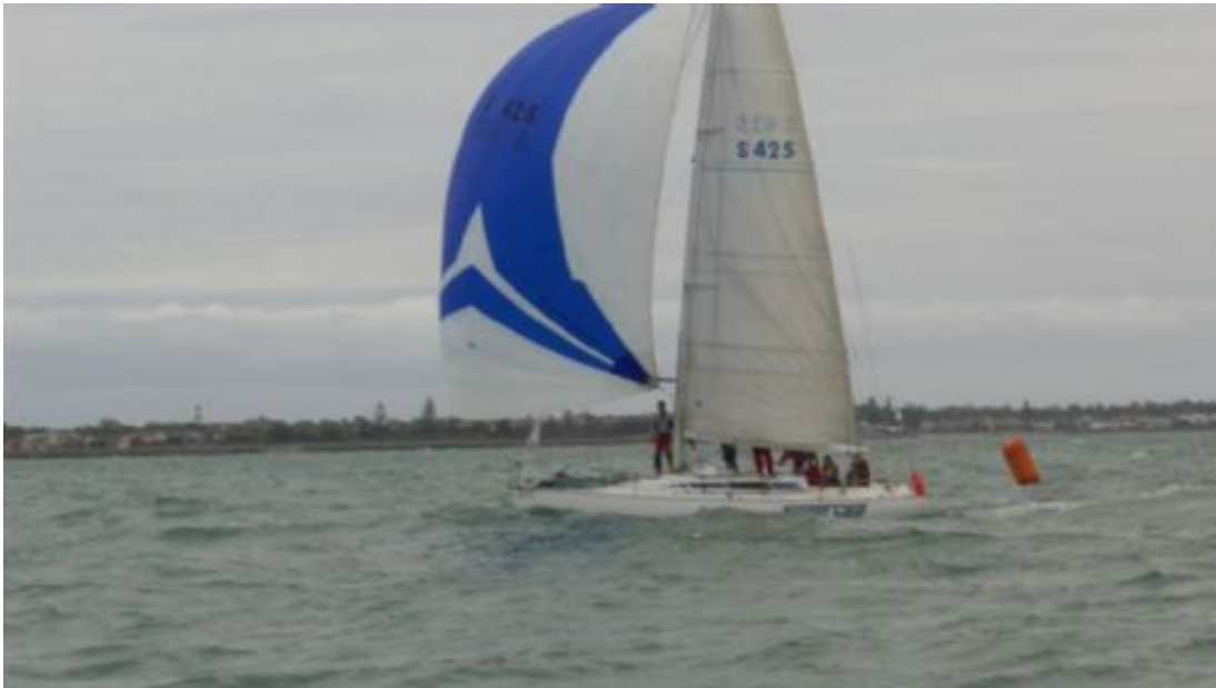
Winner of the 2008 Cactus Cup, S425 "Silicon Chip"