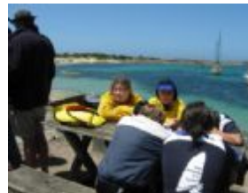
2008 Stonehaven Cup Regatta in King Island