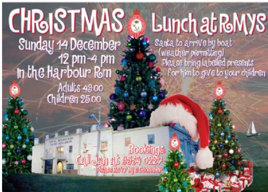
Christmas Lunch at RMYS

Christmas Lunch at Royal Melbourne Yacht Squadron - 38996