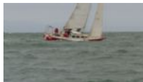
Cactus Cup 2008