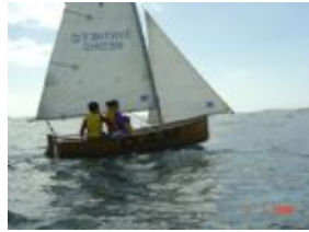
Stonehaven Cup @ King Island