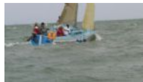
Cactus Cup 2008