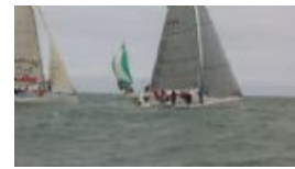
Cactus Cup 2008