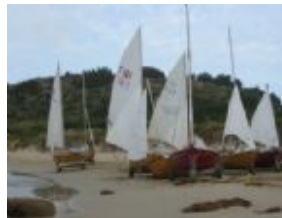
2008 Stonehaven Cup Regatta in King Island