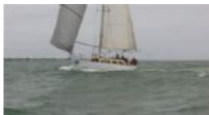
Cactus Cup 2008