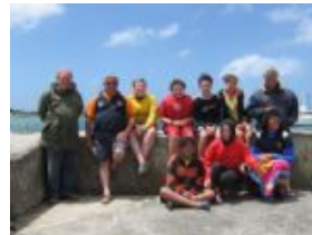
2008 Stonehaven Cup Regatta in King Island