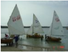
Stonehaven Cup @ King Island

Click Here for results published on RBYC Website