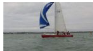
Cactus Cup 2008