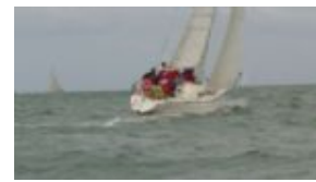
Cactus Cup 2008