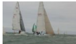
Cactus Cup 2008