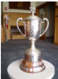
The Cactus Cup donated in 1940 by Jim Thorpe