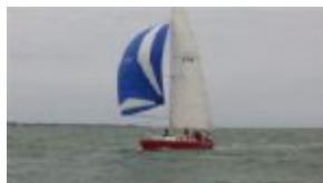
Cactus Cup 2008