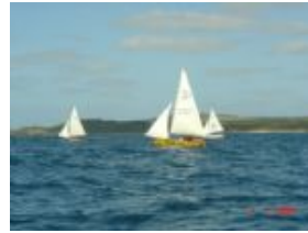
Stonehaven Cup @ King Island