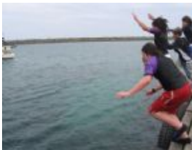
2008 Stonehaven Cup Regatta in King Island