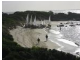
2008 Stonehaven Cup Regatta in King Island