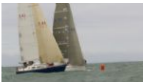
Cactus Cup 2008