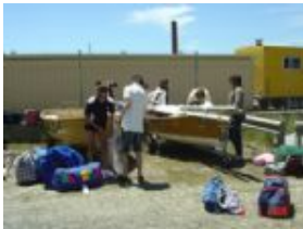
Stonehaven Cup @ King Island