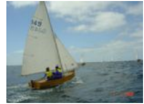
Stonehaven Cup @ King Island