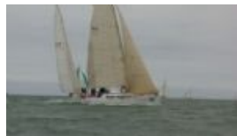
Cactus Cup 2008