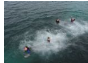
2008 Stonehaven Cup Regatta in King Island